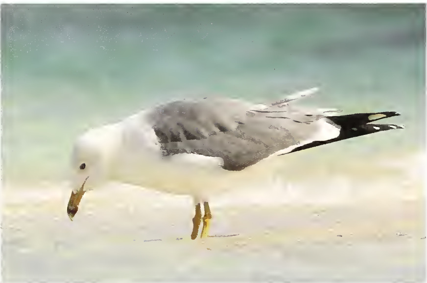
Figure 4. Adult Steppe Gull Larus (fuscus) barabensis , Dahret Island, 25 January 2009 (Giuseppe De Marchi) Goéland des steppes Larus (fuscus) barabensis adulte, île de Dahret, 25 janvier 2009 (Giuseppe De Marchi)